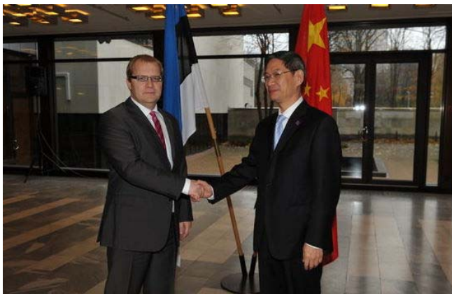
Foreign Minister Urmass Paet with Vice Foreign Minister of China Zhang Zhijun, 2 November.

Foreign Minister Paet stated that educational co-operation between Estonia and China is also developing successfully. "Over 100 young Chinese people are studying in Estonian institutions of higher learning, and we hope that the number of Estonian students gaining a Chinese education will also increase little by little," said Paet. "Signing an agreement for the reciprocal recognition of higher education diplomas and qualifications would help to increase educational and research co-operation," Paet added.